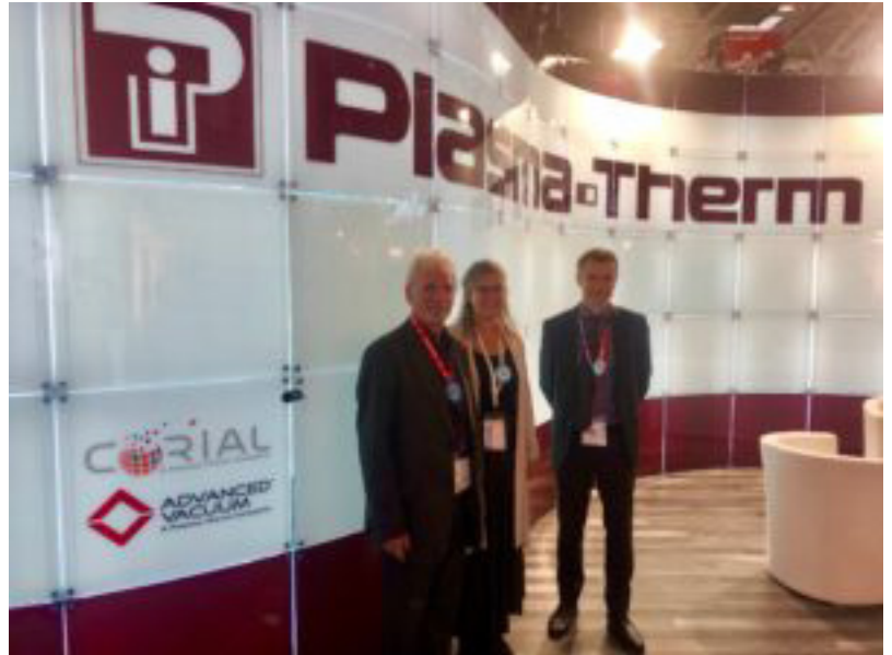
Hanging out with the Plasma-Therm team.

"We never crushed a company to take its IP," he said. "Rather, we focus on investing in them for the products and make them better." They focus acquisitions on plasma-based equipment and then form partnerships with adjacent technologies if there is an advantage. For example, plasma dicing is done in partnership with Disco. Another example of this is the US distribution agreement with Trymax .